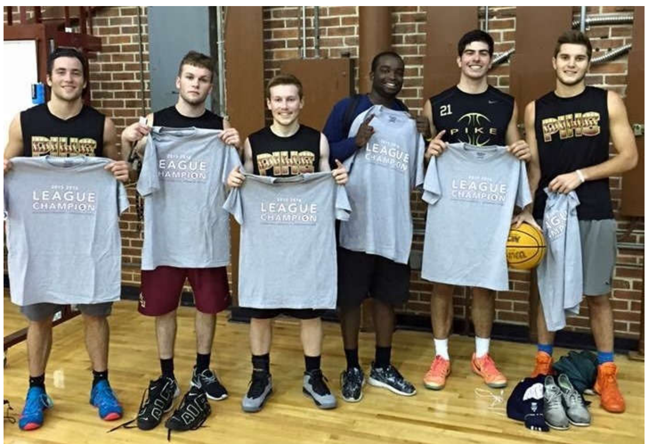
Pikes are the 2015 3x3 Intramural Basketball Champions!