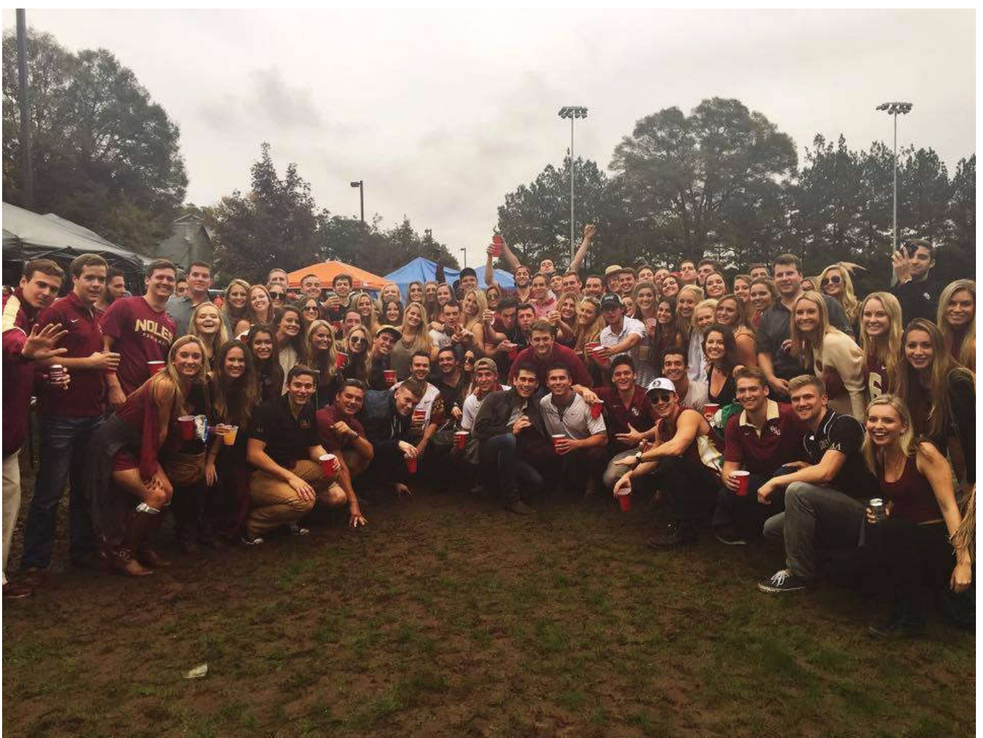
Pike Brothers and dates enjoyed a football road trip to Clemson in early November