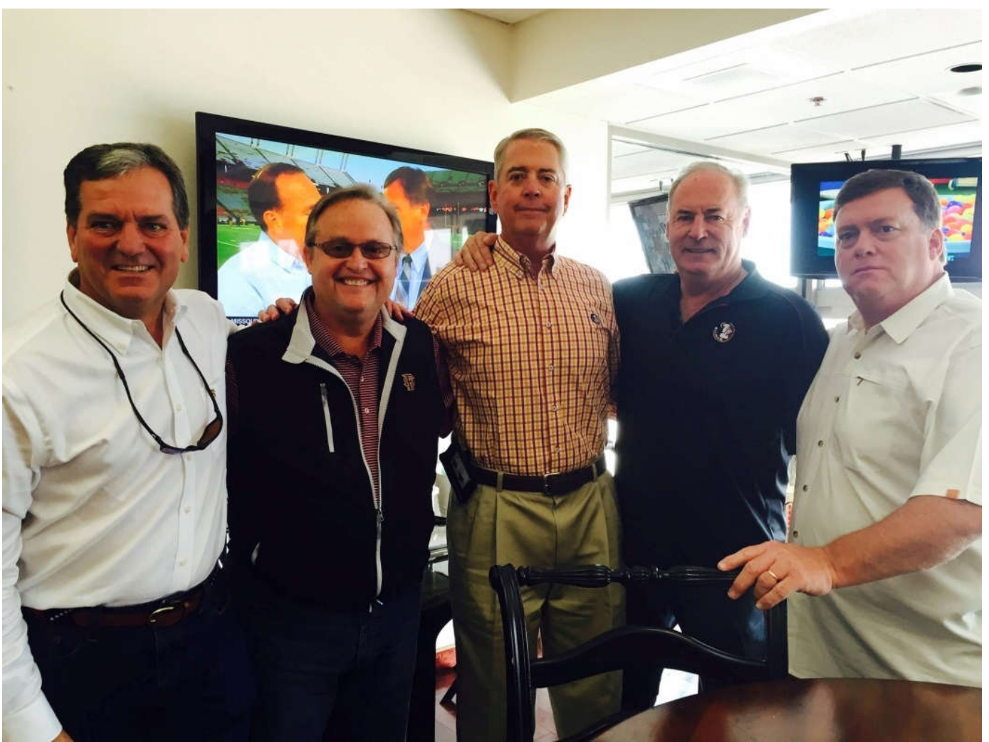
In the Pike alumni skybox at Homecoming