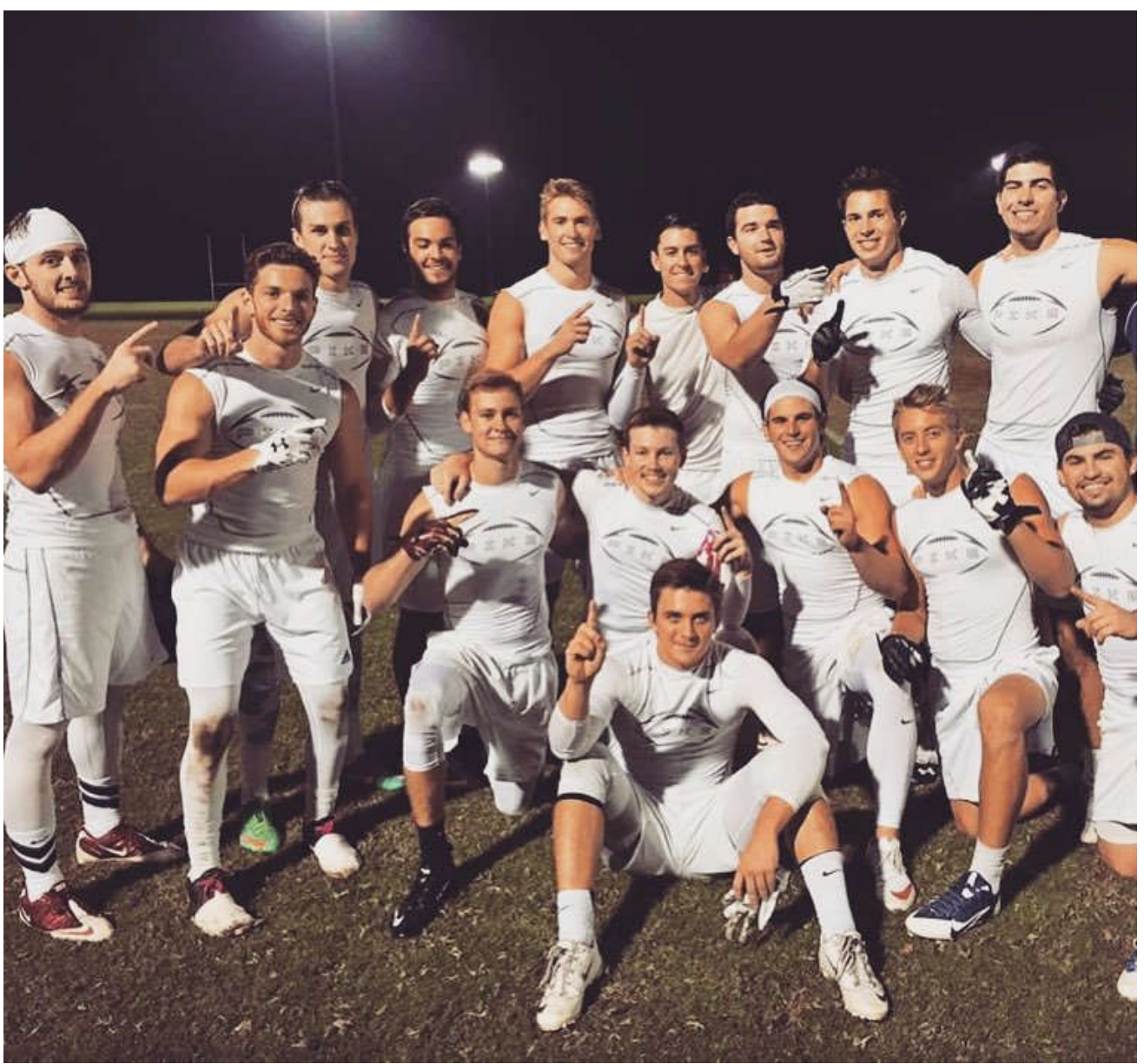
Pikes are the 2015 Intramural Football Champions!