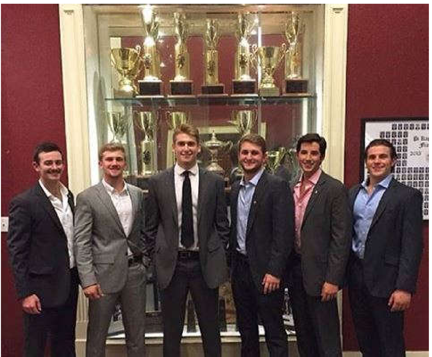
New Pike Executive Officers