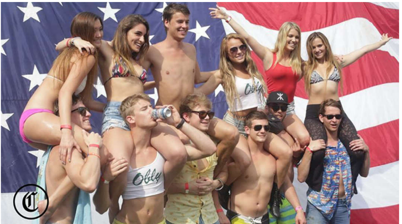
God bless America and Pi Kappa Alpha